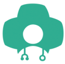
Table Companion app.